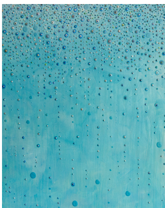
Deluge - 2007