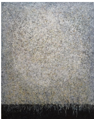
Renew - 1994

Opening Reception: Friday, Sept. 18th, 6:00 – 8:00